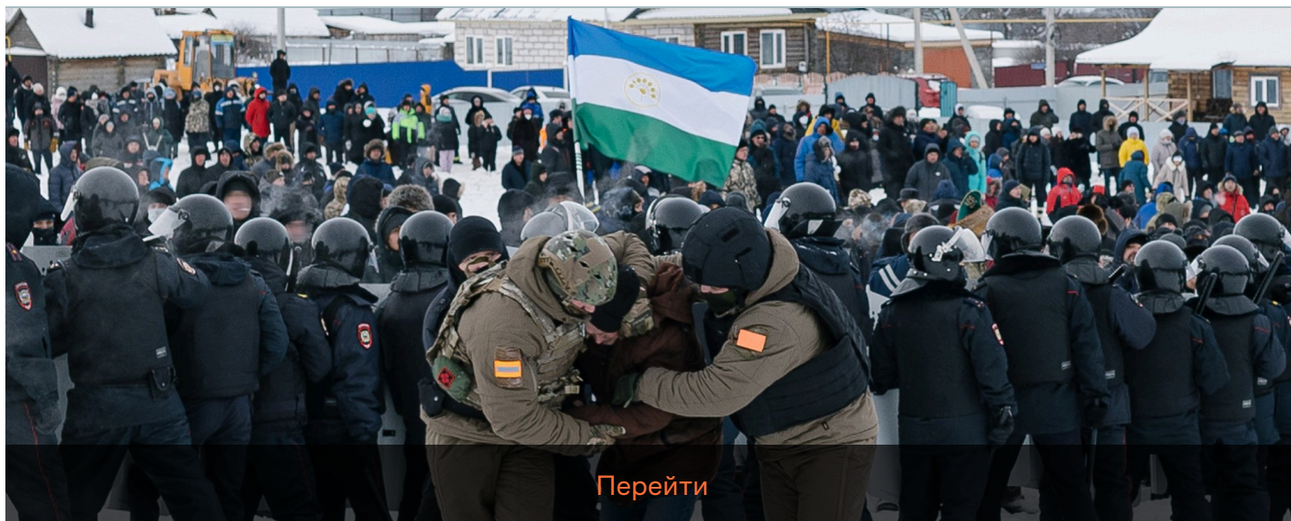
Detentions at the protest in Baymak (a town in Bashkortostan), 17 January 2024